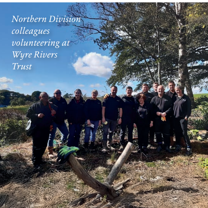
Northern Division colleagues volunteering at Wyre Rivers Trust