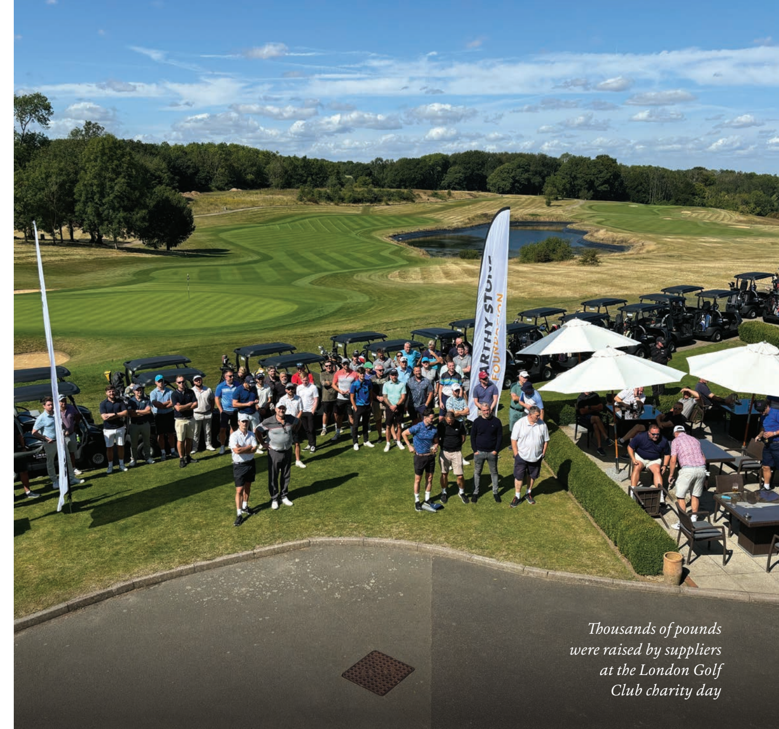
Thousands of pounds were raised by suppliers at the London Golf Club charity day