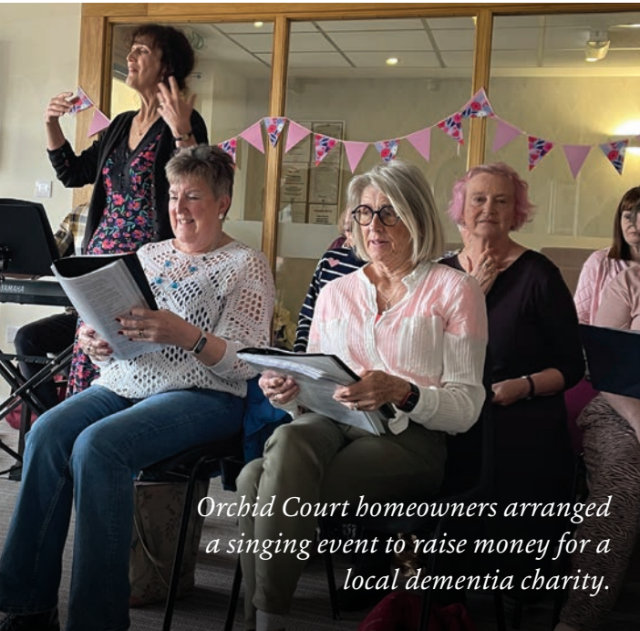
Orchid Court homeowners arranged a singing event to raise money for a local dementia charity.