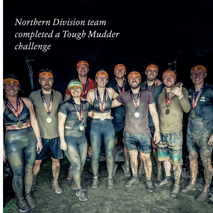
Northern Division team completed a Tough Mudder challenge