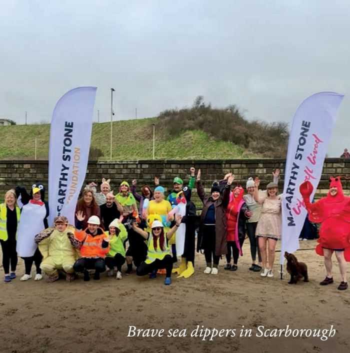
Brave sea dippers in Scarborough