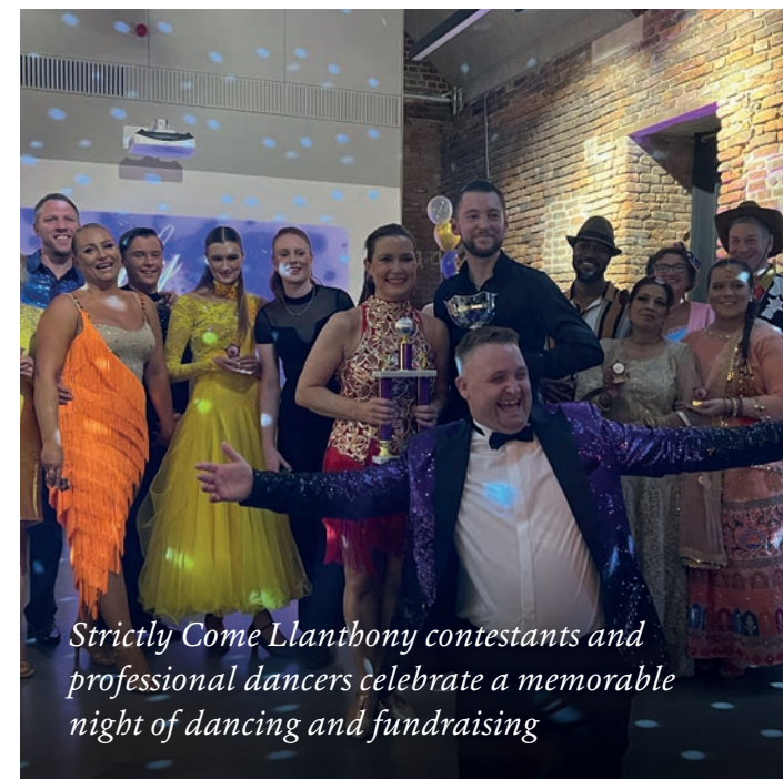
Strictly Come Llanthony contestants and professional dancers celebrate a memorable night of dancing and fundraising