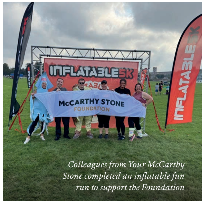
Colleagues from Your McCarthy Stone completed an inflatable fun run to support the Foundation