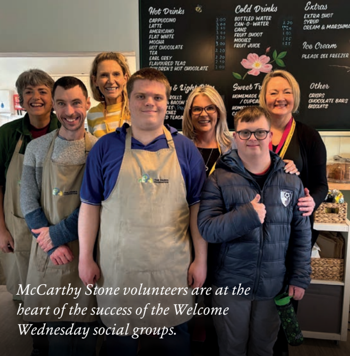
McCarthy Stone volunteers are at the heart of the success of the Welcome Wednesday social groups.