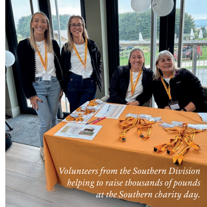
Volunteers from the Southern Division helping to raise thousands of pounds at the Southern charity day.