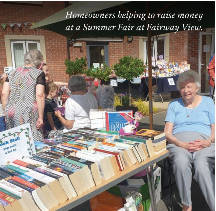
Homeowners helping to raise money at a Summer Fair at Fairway View.