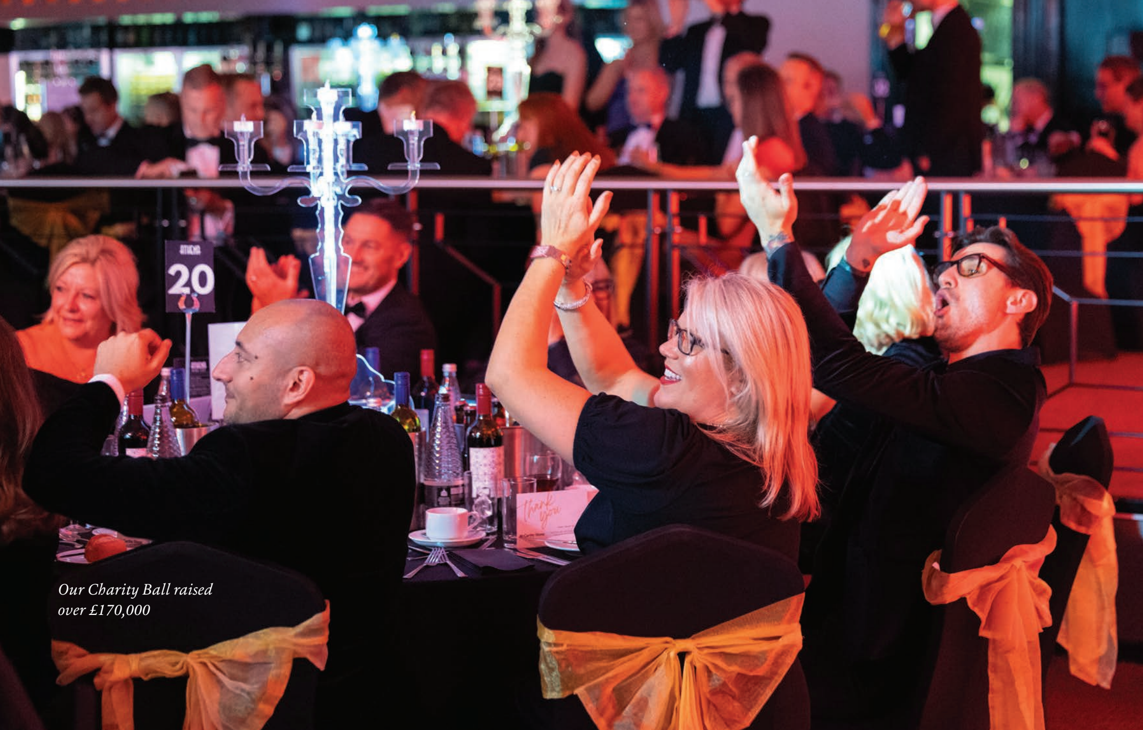
Our Charity Ball raised over £170,000