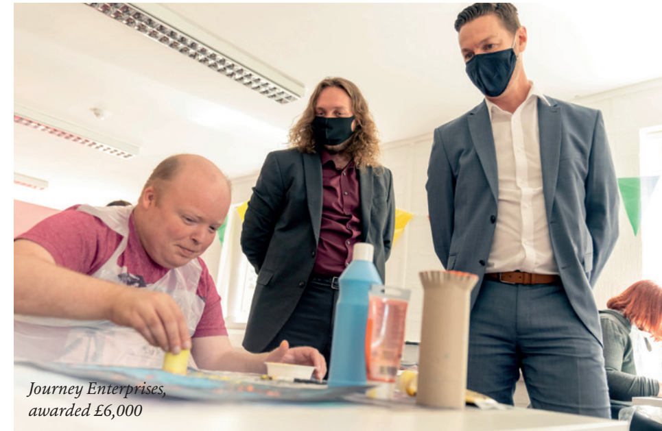
Journey Enterprises, awarded £6,000