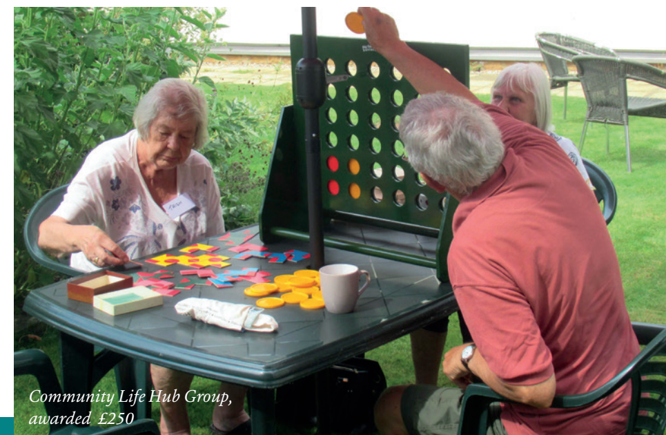
Community Life Hub Group, awarded £250