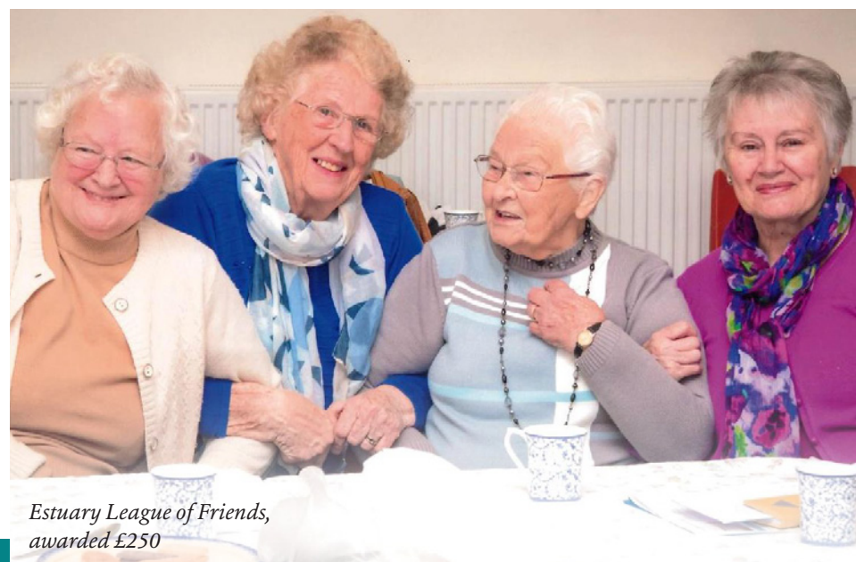
Estuary League of Friends, awarded £250