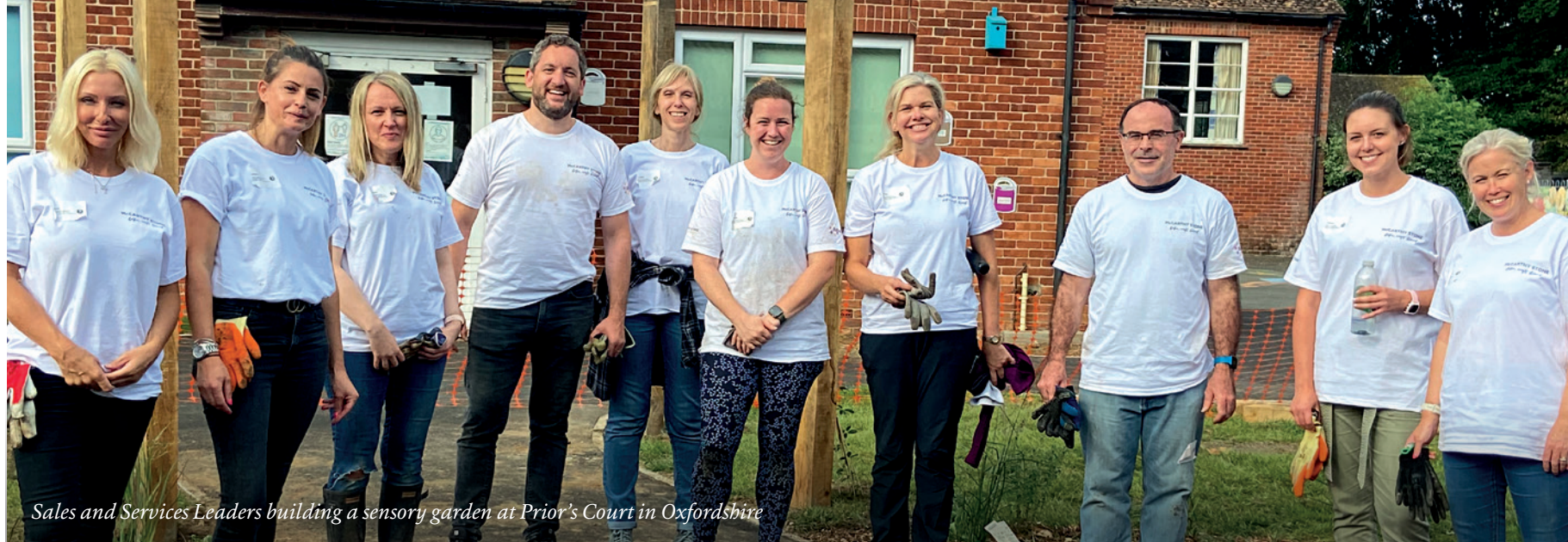
Sales and Services Leaders building a sensory garden at Prior's Court in Oxfordshire