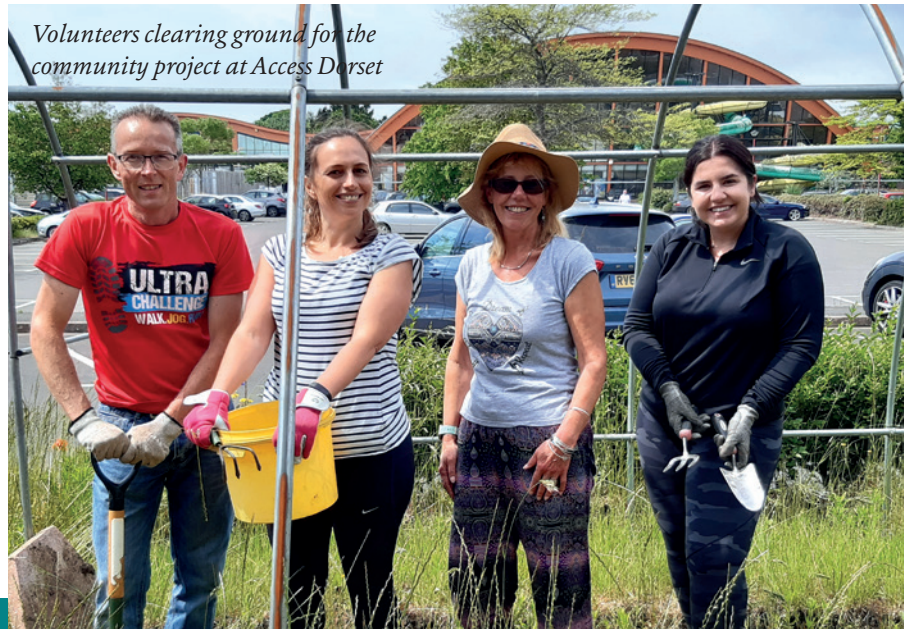
Volunteers clearing ground for the community project at Access Dorset