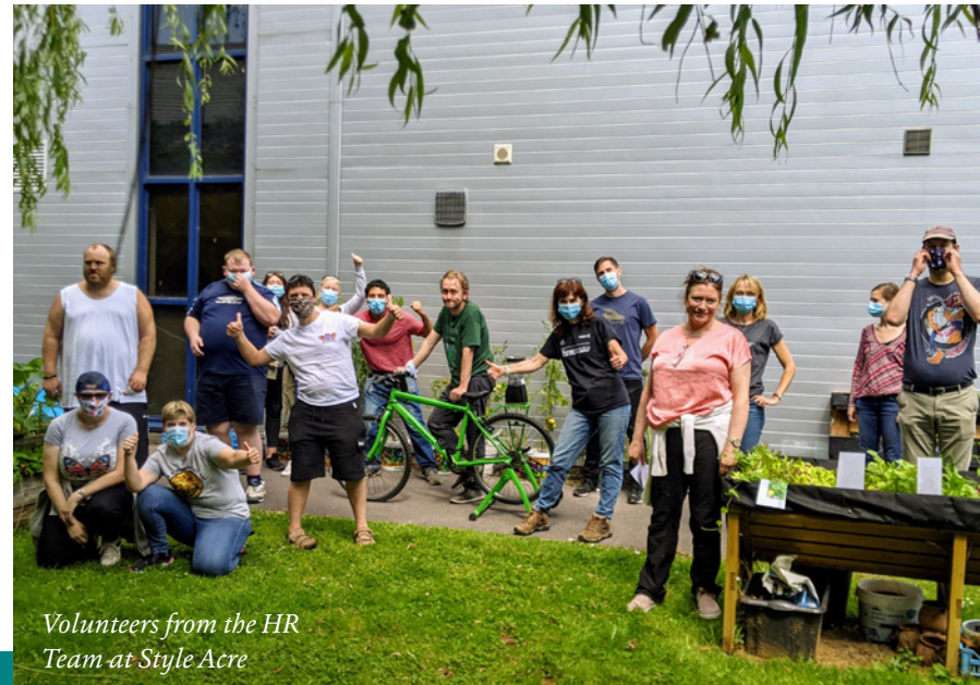
Volunteers from the HR Team at Style Acre