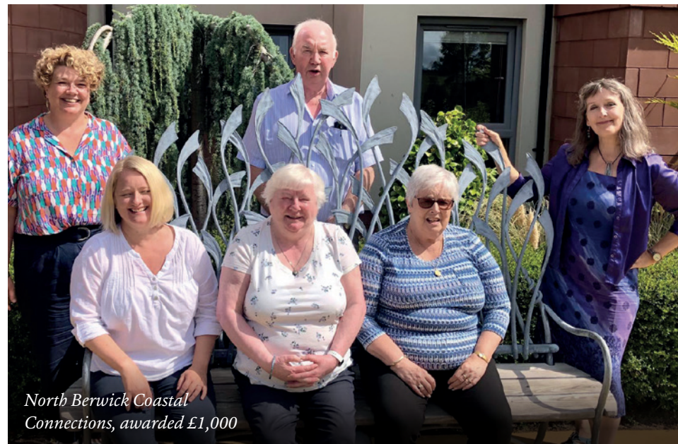
North Berwick Coastal Connections, awarded £1,000

Aiming to support small, local, grassroots organisations, funding is available to any non-profit organisation that is working to support the health and wellbeing of older people, particularly through intergenerational activity or community regeneration. The following are a few examples of some of the charities and community groups we have worked with in 2021, many of which we're continuing to support in the new year.